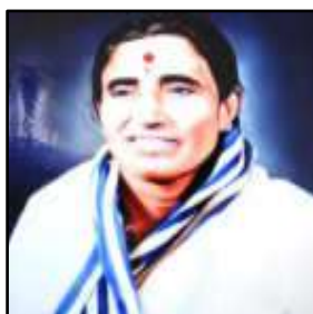
Late Hon.Smt. Sharadchandrika Suresh Patil Ex. Minister of Education Maharashtra State